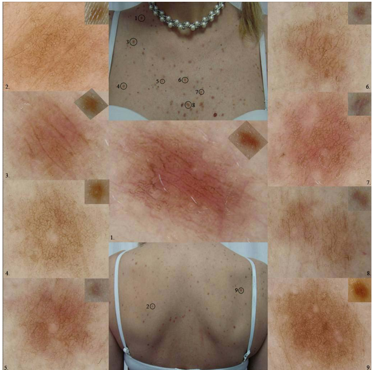
Figure 1.1-9. Mastocytosis and melanocytic nevi, clinical presentation: Numerous light brown macules and maculo-papules scattered all over the upper trunk; Figure 1.1. Dermatoscopy: Discrete irregular pigment network with linear accentuation of pigmentation along the skin folds and reddish centre in the background (Dermlite Photo dermatoscope, 3Gen LLC, Dana Point, CA x10)

Although, presented patient had onset of cutaneous mastocytosis in her middle age, she was healthy, with no systemic involvement and with negative Darier's sign. Because of the lacking symptoms associated with CM, making a correct diagnosis in this patient is challenging. However, the dermatoscopic analysis can be useful to distinguish CM from epidermal melanocytic nevi. Several studies reported dermatoscopic findings of CM. All of them agreed that maculopapular CM, is dermatoscopically presented with brown reticular lines in combination with reddish to brown blot.[1,3,4,8] Dermatoscopic analysis of pigmented lesions in the presented patient, revealed irregular reticular lines with no typical